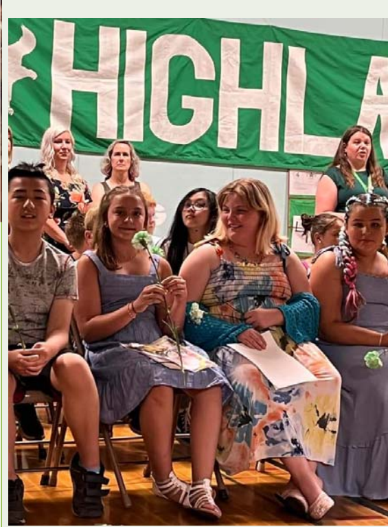
Celebrating & Moving On! A.J. Schmidt sent its fledglings on their way with song and good cheer as the school held its Kindergarten Celebration (top left) and 5th grade Moving Up Day (top right). Similar rites of passage took place at Highland for its Kindergarteners (below) and 5th graders (at left).