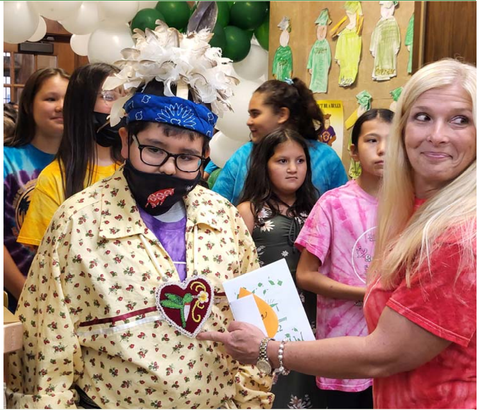
Teachers were on hand to guide students and make sure the processions went smoothly during the Kindergarten Celebration and 5th Grade Moving Up Day events at J.T. Waugh Elementary School.